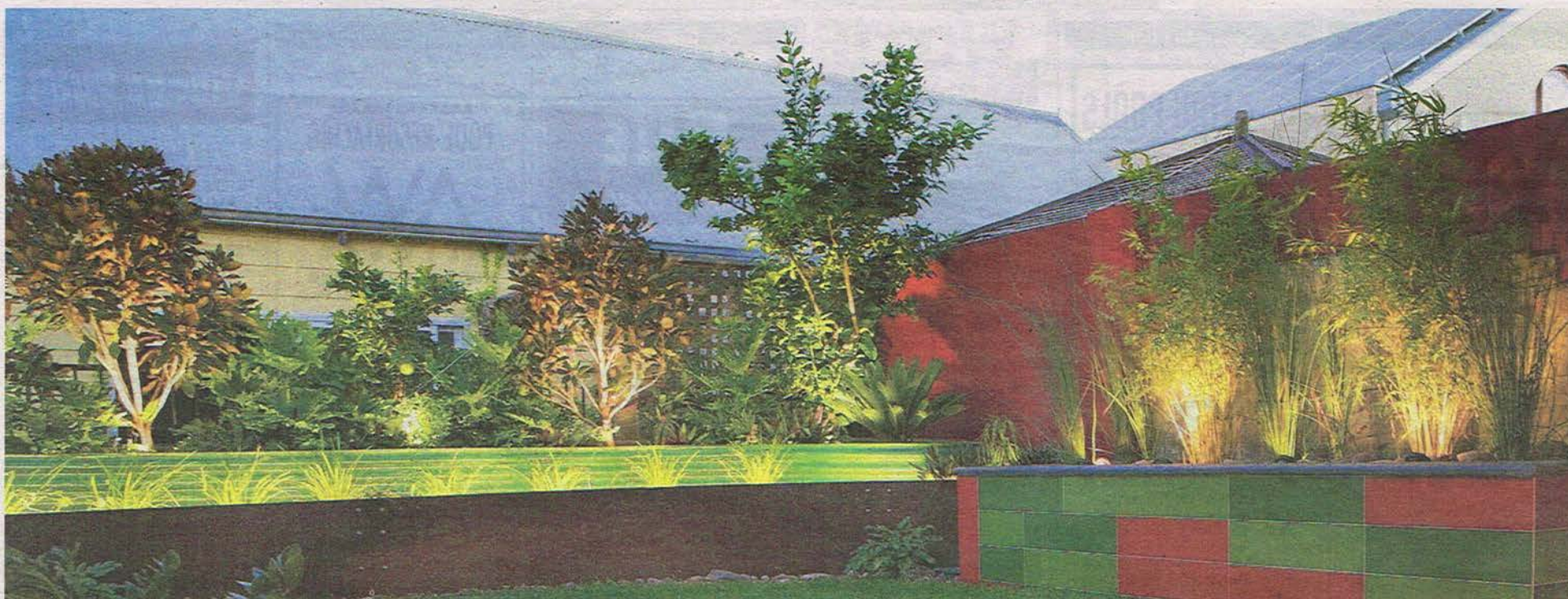
Tiered gardens make good use of the 120sqm backyard, providing dense plantings and definition around the perimeter walls.